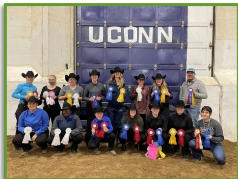
UConn Western Team at home show