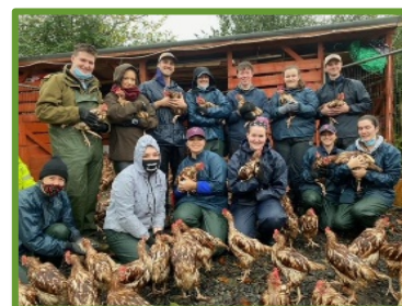
University of Glasgow students with two UConn alumnae

https://animalscience.uconn.edu/anfccareers.php