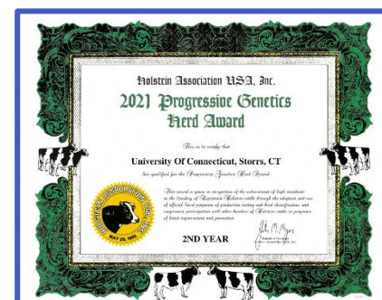
2021 Progressive Genetics Herd Award

Our homegrown UConn dairy ladies (and their exceptional caretakers!) were awarded, for the second time, the 2021 Progressive Genetics award from the Holstein Association. This award recognizes the high standard of Holstein breeding we have attained and our exceptional production testing and herd classification programs. Additionally, the herd has been awarded the Agri-Mark Quality Performance award in recognition of our high quality milk production. We congratulate all of those who work so hard to achieve this level of excellence with our dairy herd!