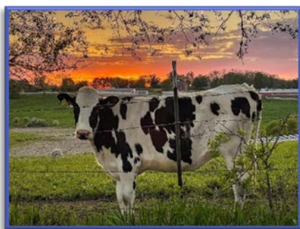
Dairy heifer and Horsebarn Hill sunset