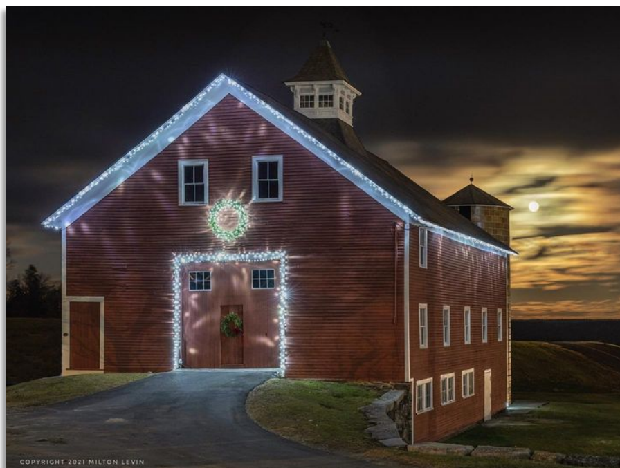
Jacobson Barn