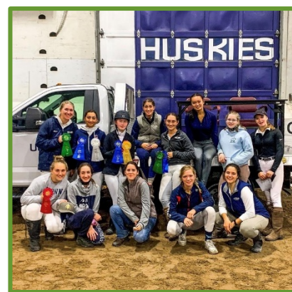
UConn Dressage Team at home show