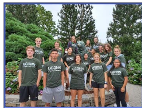
Members of the ANSC learning community posing with the beloved Jonathan statue