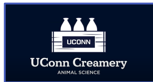
UConn Creamery Logo