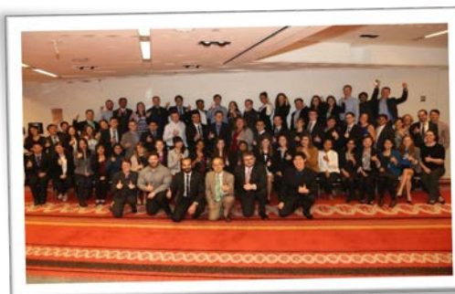
A group of 50 early-career scientists at NYAS