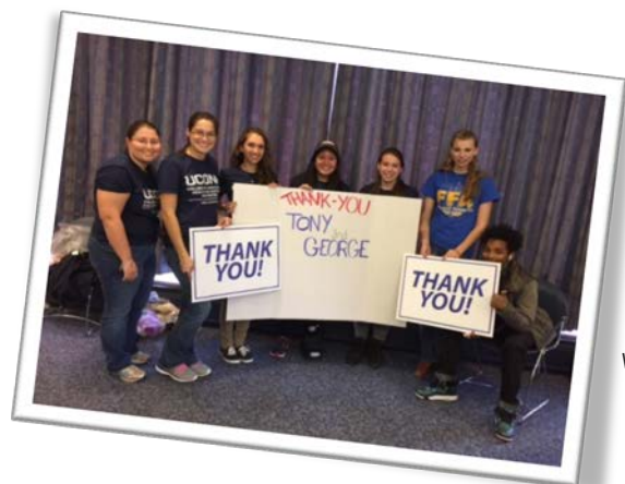
Volunteers, both ANSC students and supporters, who helped organize a successful shoe sale