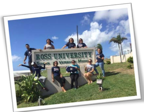
ANSC Alumni currently at Ross University in St. Kitts

The UConn Huskies studying veterinary medicine at Ross University in St. Kitts came together to get a group photo! ANSC Alumni currently studying there are: