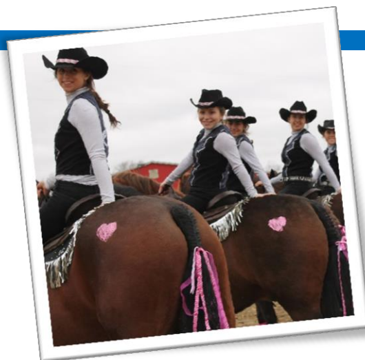
Members of the UConn Morgan Drill Team pose for a photo after their demonstration at the Little "I" Show

For information and applicable forms for CAHNR Scholarships click here .