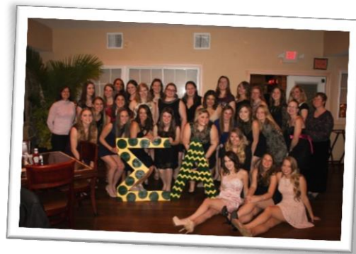
Members of the Sigma Alpha sorority pose during their annual Emerald Ball

The Sigma Alpha sorority hosted their annual Emerald Ball at Lakeview Restaurant in Coventry, CT. The theme of the ball was "Belles and Beaus" and both sorority members and their guests enjoyed a great meal and a night of socializing and dancing.