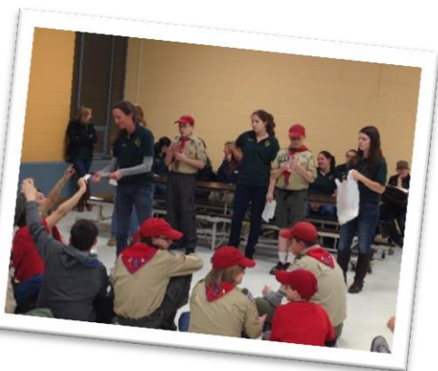
Members of Sigma Alpha give a demonstration to Boy Scout Troup 2

Last fall, the Sigma Alpha sisters presented four topics concerning agriculture and nutrition to Boy Scout Troup 2 at Tolland Middle School. They created some interactive games that taught the boys about the steps involved in milking a dairy cow, sources of calcium and why it's necessary in the diet of young people, growing vegetables used in making chili, and the sugar content of popular snacks and drinks. The event was fun for all involved!