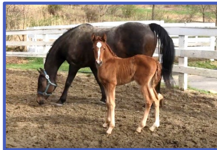
“Pippa” and UC Holiday Pride