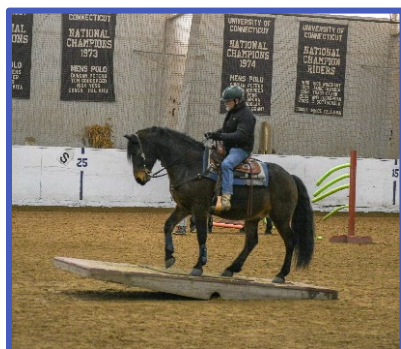
A symposium participant taking a horse over an obstacle

Read more about this event in an article in The Daily Campus here .