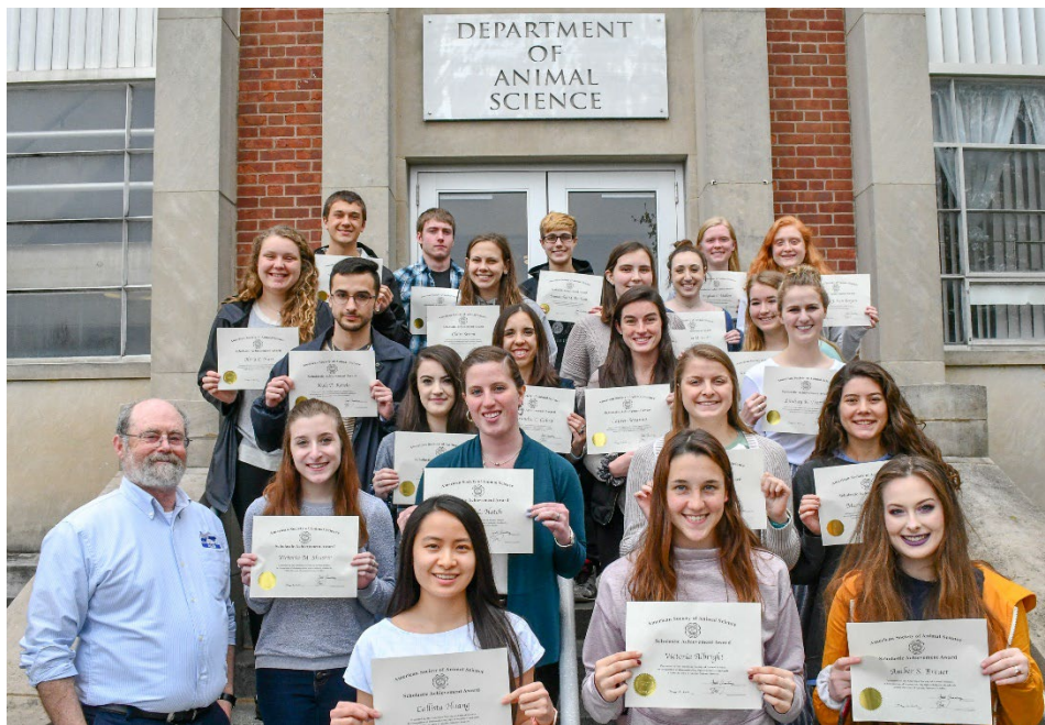
Animal Science Undergraduates with their American Society of Animal Science Undergraduate Awards Spring 2019