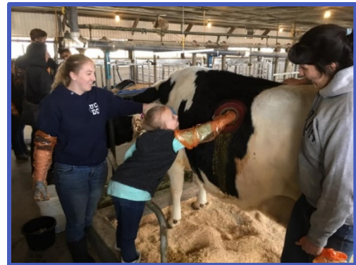
A 4-H student working with the fistulated cow