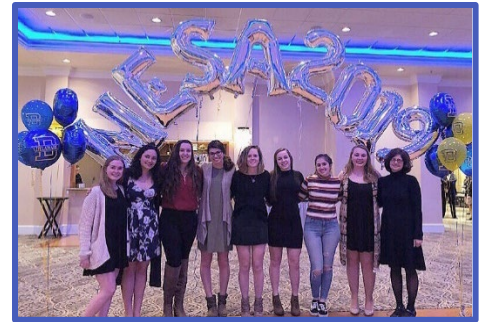
Block & Bridle Club at the 2019 NESA meeting

UConn Block and Bridle Club attended the North East Student Affiliate (NESA) competition at the end of February at the University of Delaware. The club placed 6 th overall, with one of their judging teams placing 2 nd out of thirty-three teams, and two individuals placing 7 th and 9 th out of all the competitors. Congratulations to all of our students who participated!