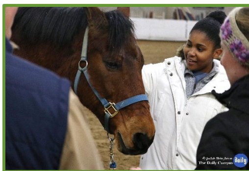
A participant in the Hands-on Horse Science demos greets a UConn Morgan Horse