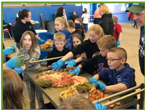
4-H students interacting with ruminant digestive tracts

On March 16 th , UConn Extension hosted a 4-H Dairy and Beef Day with the help of students, staff and animals from the UConn Department of Animal Science. The attendance included 160 youth from ages five to eighteen and 50 4-H volunteers and parents. The event strived to encourage youth in science to participate in an activity they are passionate about, in this case dairy and beef animals. This year, the hands-on activity involved the digestive tract. Veterinarians from the Tufts University School of Veterinary Medicine came to the event to walk students through the ruminant digestive tract using real digestive tracts. Additionally, UConn's own fistulated cow was used to show students the fermenting contents of the ruminant digestive tract. This program was a great hands-on experience for these 4-H STEM students!