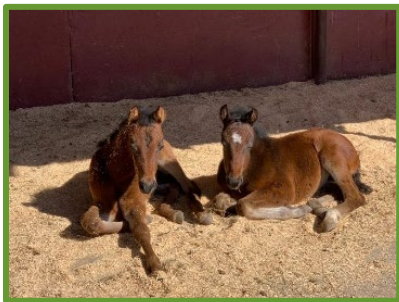
“April” and “Prim”