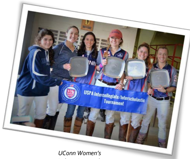
UConn Women's Polo at Regionals