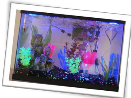
Glow Fish tank in George White Main Office

We encourage students to relax and enjoy the fish in the 212 lounge and see the fish in the main office as well!