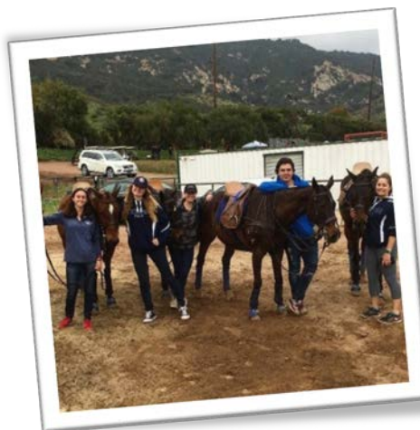
UConn Women's Polo at Nationals