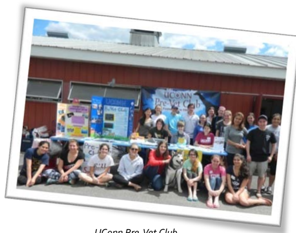
UConn Pre-Vet Club

The Pre-Vet Club Dog Wash will be held on Saturday, April 29 th at the Kellogg Dairy Center. All friendly dogs with up to date rabies vaccines are welcome. See the flyer for more information here .