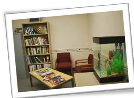
Fish tank in George White 212 lounge