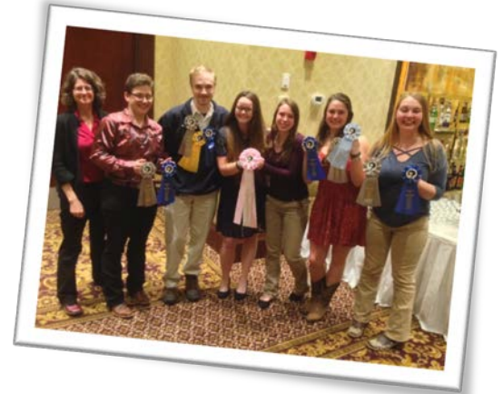
B&B Club at NESA