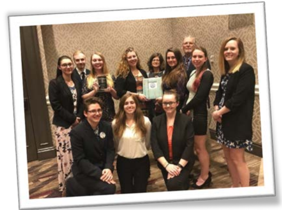
B&B Club at National Convention