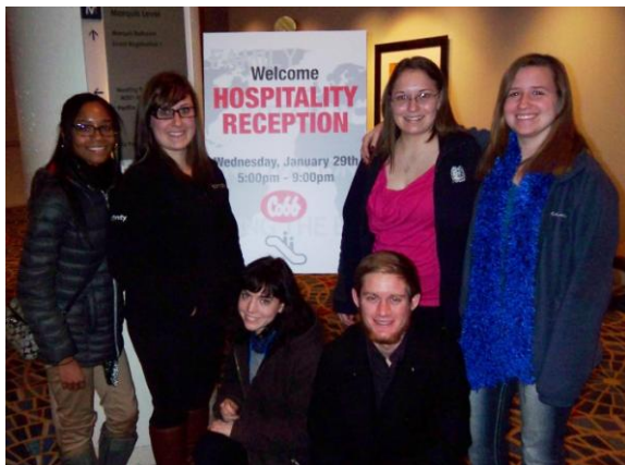
UConn Poultry Club at World Congress Center in Atlanta, GA. Club members work hard at fundraising to help cover travel expenses. They must attend at least two fundraising events and help at the Annual 4-H Poultry Show to be eligible to travel to Atlanta.