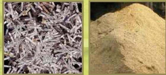
Examples of bedding

There are also various types of bedding to choose from, making it easy to choose the best type of bedding for you and your horse. Kinds of bedding and their pros and cons include: