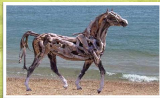
Horse sculpture made of recycled wood